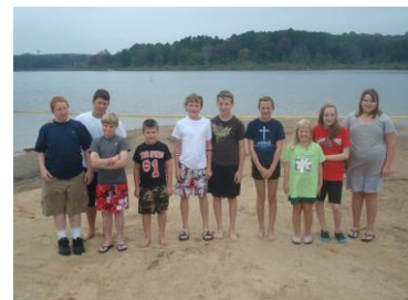
Youth baptized at Sandy Beach on September 25

Karen Callaway 1342 Heber Springs Rd. Heber Springs, AR (501) 362-1922